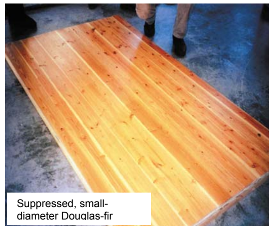
Suppressed, small-diameter Douglas-fir

Although hardwood species are generally more popular as a flooring material, higher density softwood species are also used. Softwood species that are regularly manufactured into flooring include southern pine, Douglas-fir, western hemlock, and western larch. Hardness and shrinkage values for these species are summarized in Table 1. Hardness values of these softwoods are 33% to 53% less than those of red oak, and 12% to 35% more stable (red oak is a standard hardwood comparison used by the flooring industry).